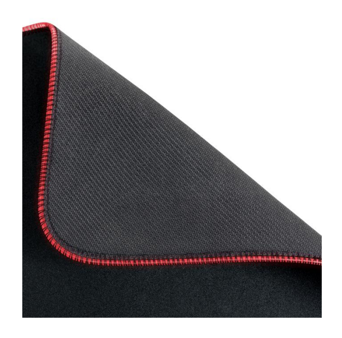
Non-slip Rubberized Base