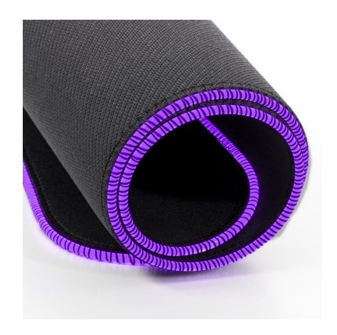
Soft body for maximum comfort